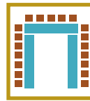
Table with chairs all around it.